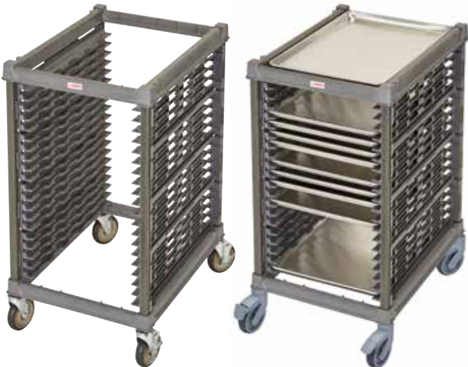
Metal Caster UPR1826H20 $ 565.00