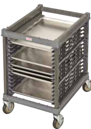
UPR1826U15 $ 540.00