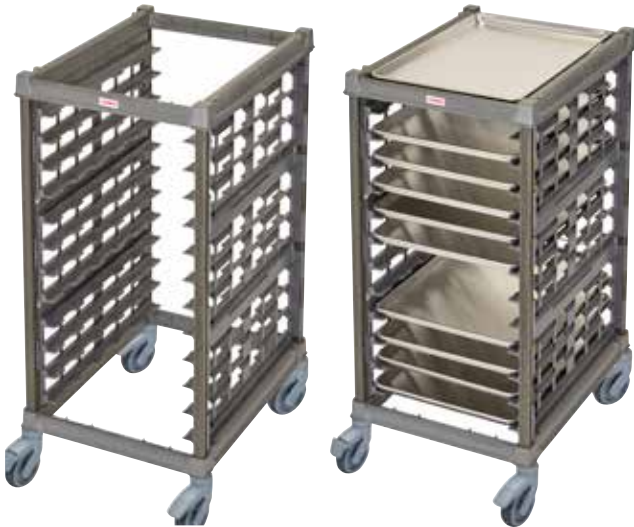
Metal Caster UPR1826H12 $ 510.00