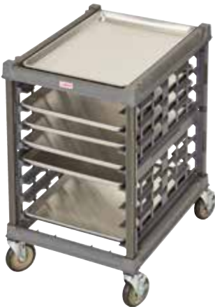
UPR1826U8 $ 495.00