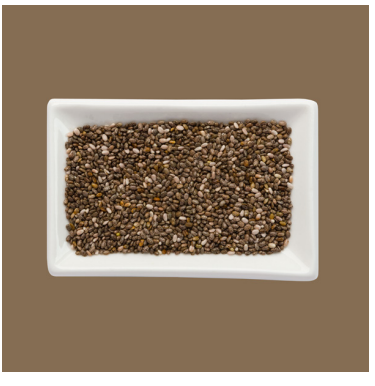
Chia Seed Oil: Excellent source of natural energy, essential omega fatty acids, and antioxidants<sup>*</sup>