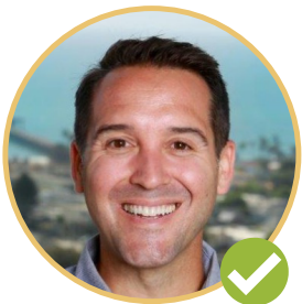
MATT LAVERRE VENTURA COUNTY BOARD OF SUPERVISORS DISTRICT 1