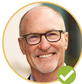
GREGG HART STATE ASSEMBLY DISTRICT 37