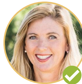
KELLY LONG VENTURA COUNTY BOARD OF SUPERVISORS DISTRICT 3