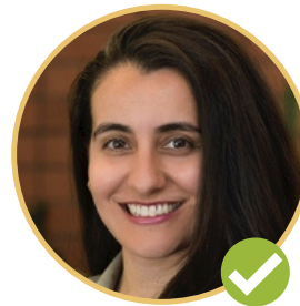
MONIQUE LIMON STATE SENATE DISTRICT 21