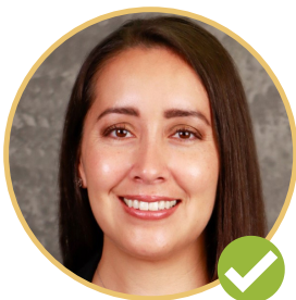
VIANEY LOPEZ VENTURA COUNTY BOARD OF SUPERVISORS DISTRICT 5