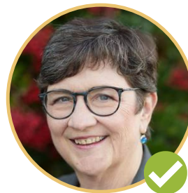
SUSAN FUNK SAN LUIS OBISPO COUNTY BOARD OF SUPERVISORS DISTRICT 5