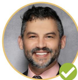
DAS WILLIAMS SANTA BARBARA COUNTY BOARD OF SUPERVISORS DISTRICT 1