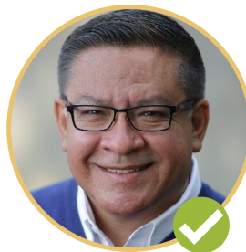
SALUD CARBAJAL U.S. CONGRESS DISTRICT 24