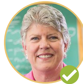
JULIA BROWNLEY U.S. CONGRESS DISTRICT 26