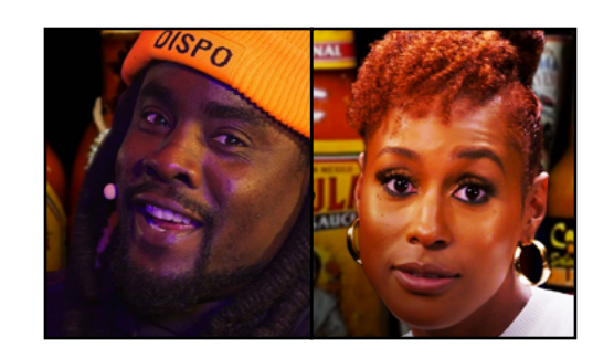
HOT ONES With Wale & Issa Rae Complex