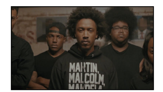
BOBBY SESSIONS "Pick A Side" - Music Video Def Jam Records