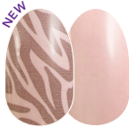
All Wild Up creme