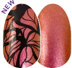
Wing It On shimmer