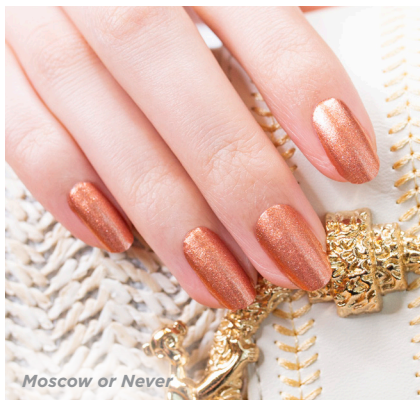
Moscow or Never