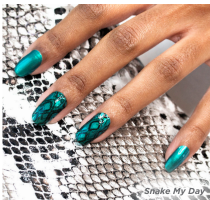
Snake My Day