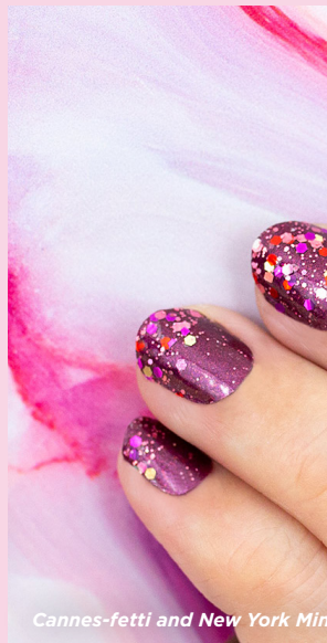
Cannes-fetti and New York Min