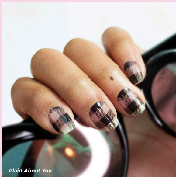
Plaid About You