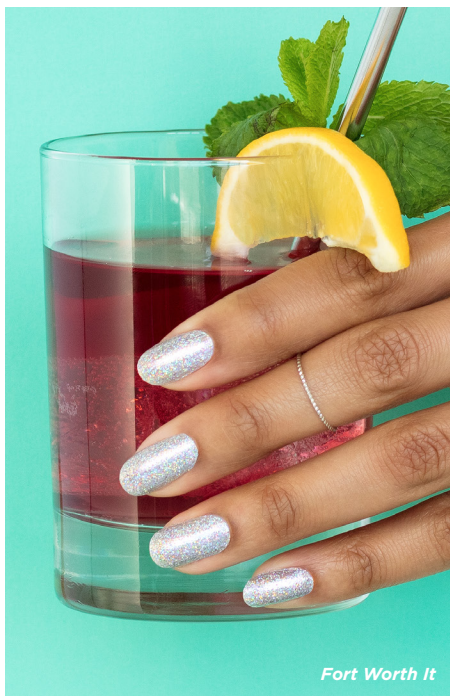
Fort Worth It

*Half-price items must be individual items only, not discounted packages.