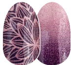
Rule of Plum shimmer