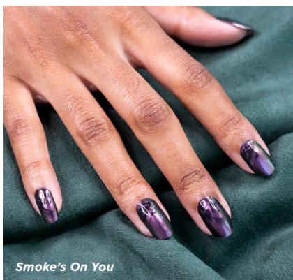
Smoke's On You