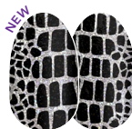
Hiss and Make Up