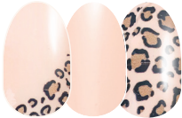
Trend Spotted creme