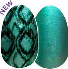
Snake My Day shimmer