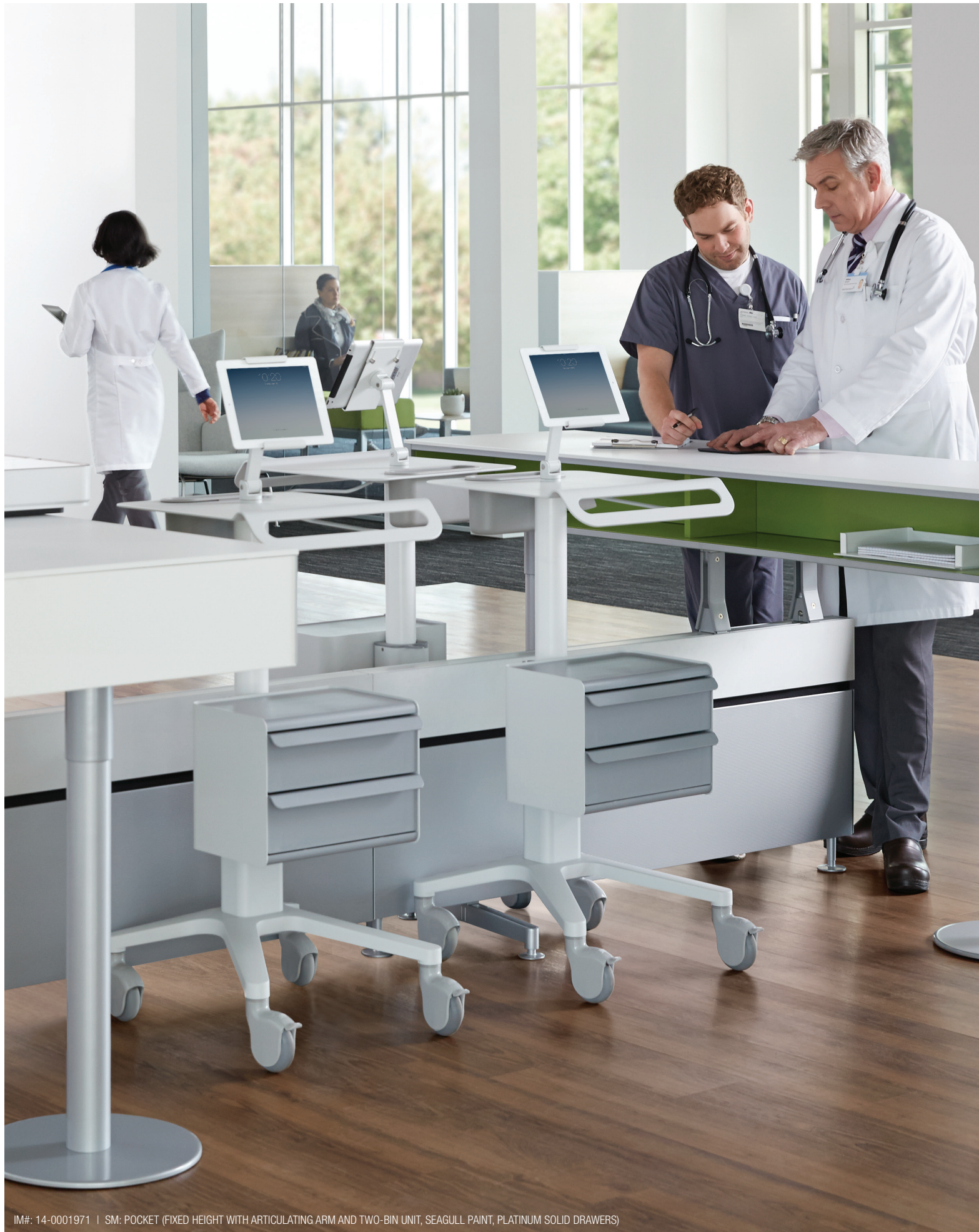
IM#: 14-0001971 | SM: POCKET (FIXED HEIGHT WITH ARTICULATING ARM AND TWO-BIN UNIT, SEAGULL PAINT, PLATINUM SOLID DRAWERS)