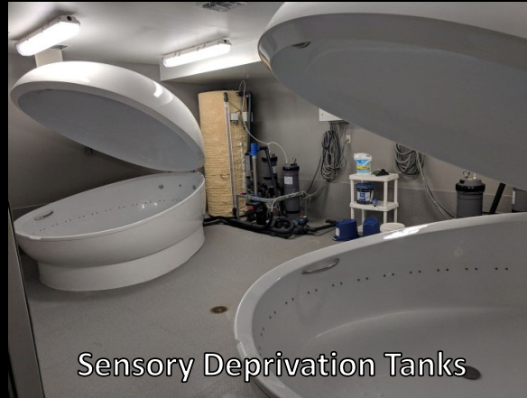
Sensory Deprivation Tanks