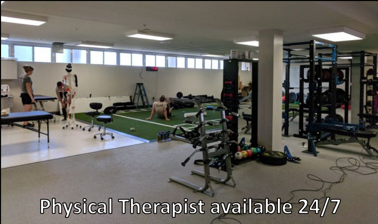
Physical Therapist available 24/7