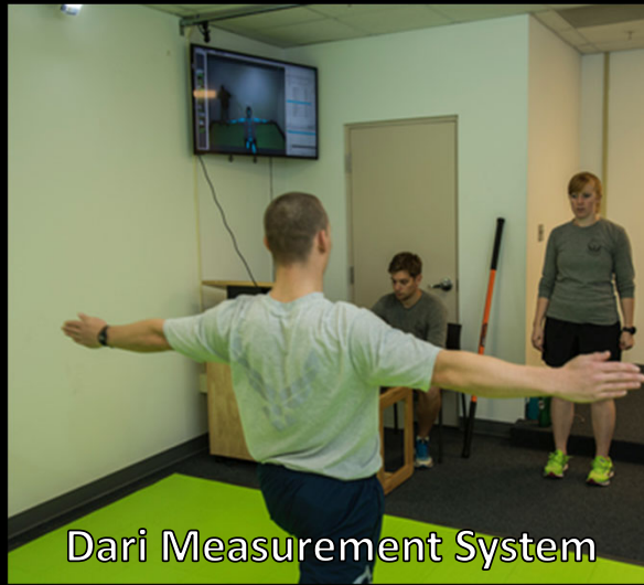
Dari Measurement System