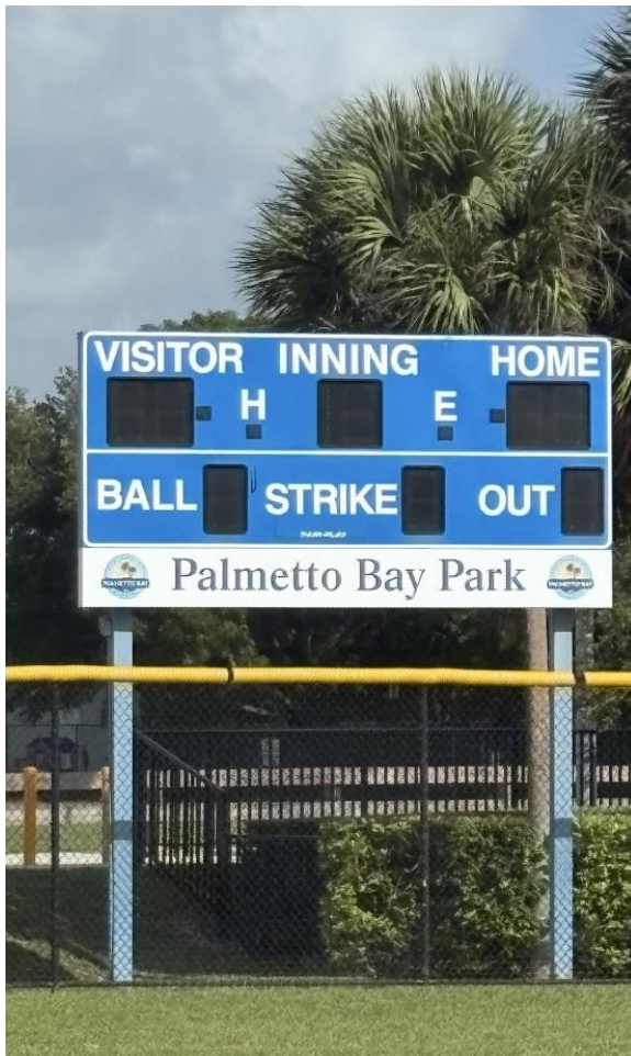
New Fairplay scoreboard control