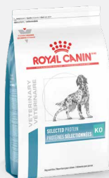
SELECTED PROTEIN KO (KANGAROO)