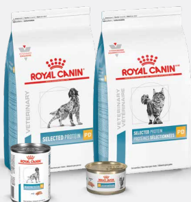
SELECTED PROTEIN PD (DUCK)