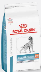
SELECTED PROTEIN PW MODERATE CALORIE (WHITEFISH)