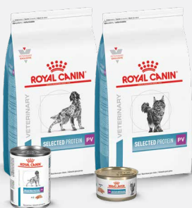
SELECTED PROTEIN PV (VENISON)