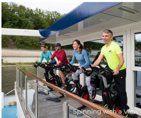
Spinning with a View