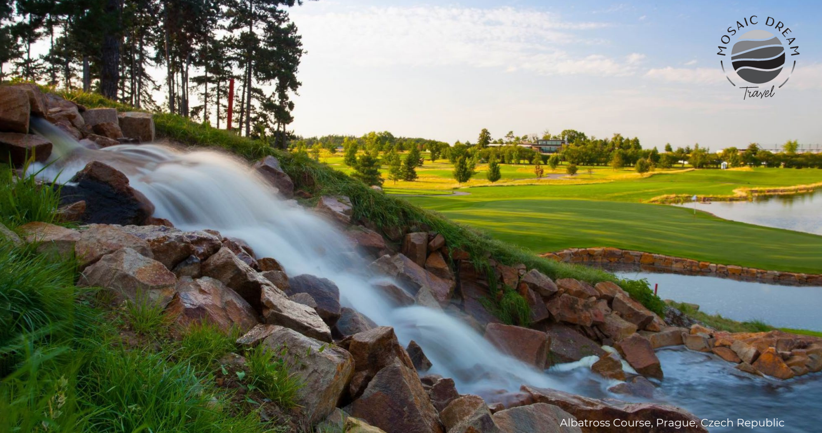
Albatross Course, Prague, Czech Republic