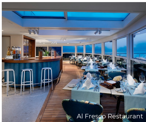
Al Fresco Restaurant

Experience the ultimate in luxury, whether you're exercising in the expansive Zen Wellness Studio or enjoying the views from the full balcony in your stylish suite. With five bars, four unique restaurants, a heated sun-deck pool and whirlpool, the AmaMagna has quickly become the most luxurious cruise ship on the Danube River.