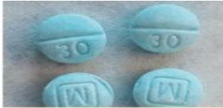
Counterfeit Oxycodone laced with fentanyl