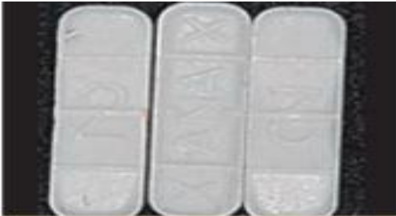
Counterfeit Xanax laced with fentanyl