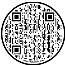
Fortune 500 Article