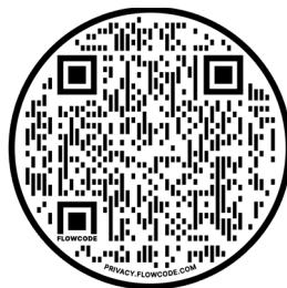
W. R. Berkley Corporation Financial Highlights