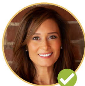
ROSILICIE OCHOA BOGH STATE SENATE DISTRICT 19