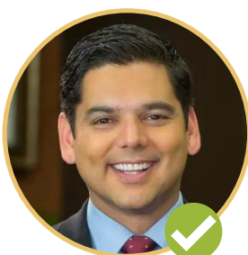
RAUL RUIZ U.S. CONGRESS DISTRICT 25