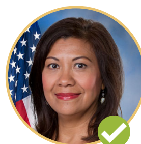
NORMA TORRES U.S. CONGRESS DISTRICT 35