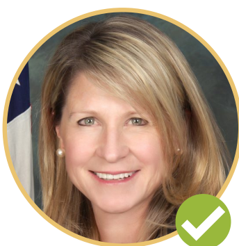
DAWN ROWE SAN BERNARDINO COUNTY BOARD OF SUPERVISORS DISTRICT 3