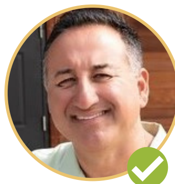
JOE BACA, JR SAN BERNARDINO COUNTY BOARD OF SUPERVISORS DISTRICT 5