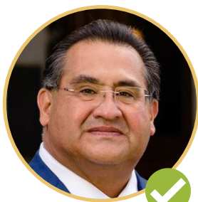
JAMES RAMOS STATE ASSEMBLY DISTRICT 45