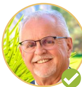
TOM LACKEY STATE ASSEMBLY DISTRICT 34