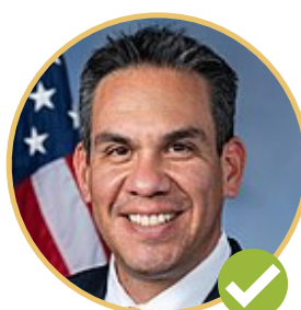
PETE AGUILAR U.S. CONGRESS DISTRICT 33