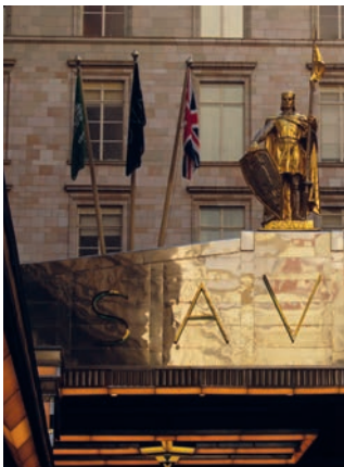
Hotels: The Savoy, London