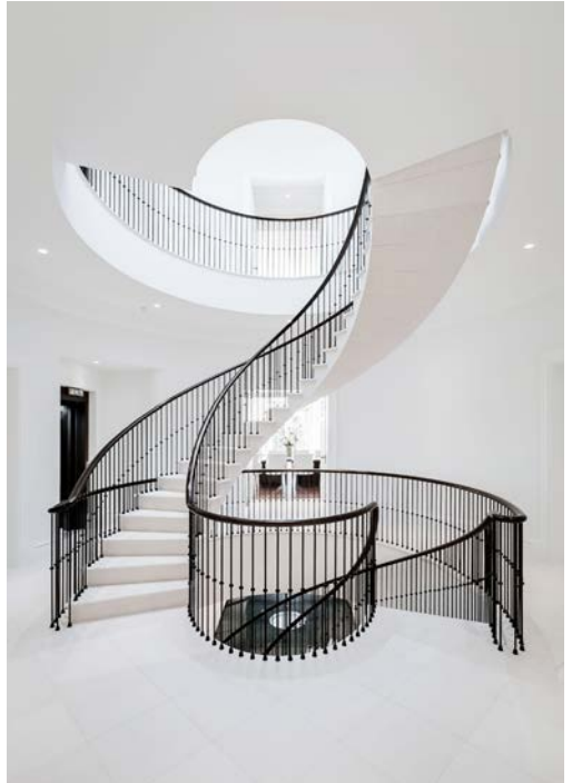
Pioneering: the world's first 270° floating stone stair, Camp End Manor