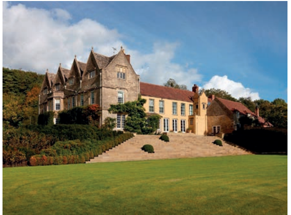
Conservation: 16 th Century manor house, Cotswolds