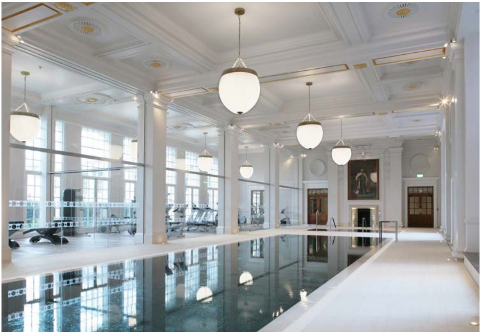
Wellness: Luxury amenities within the Star & Garter prime residential development, Richmond