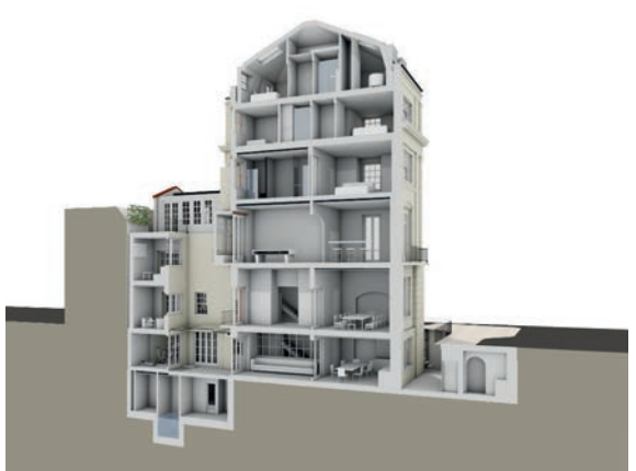
Visualisations: We 3D-model and coordinate all of our projects in BIM