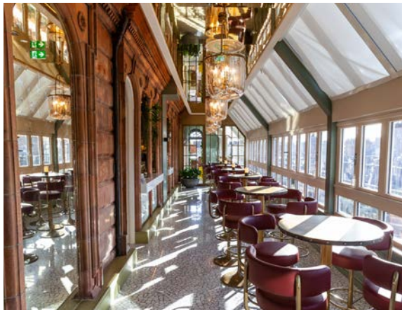
Hospitality: Perrier-Jouet Champagne Terrace, Harrods, London