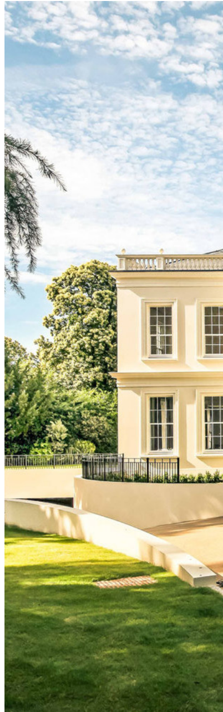
Prime development: Camp End Manor — luxury new-build home