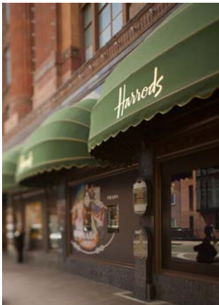
Retail: Harrods, London