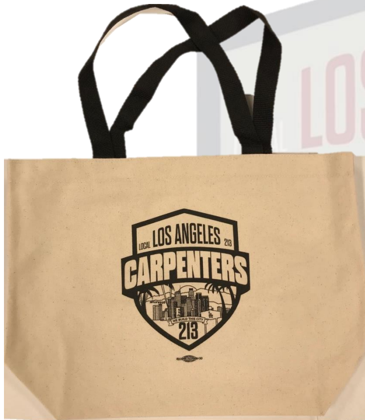
LOCAL 213 TOTE BAG $15