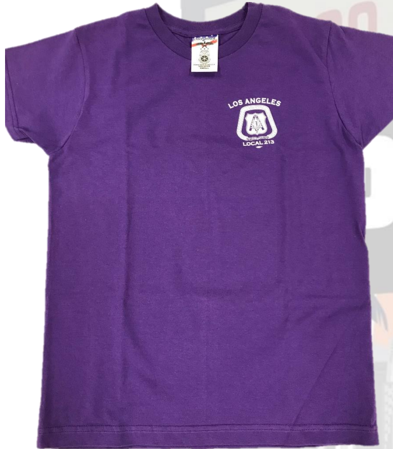
PURPLE T-SHIRT $15