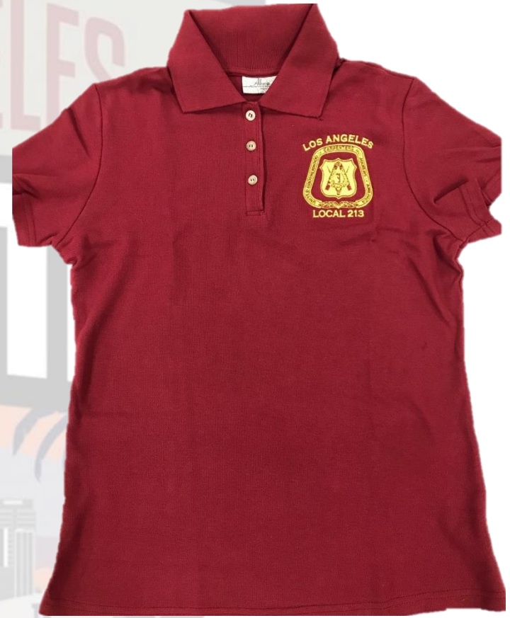
BURGANDY POLO $48