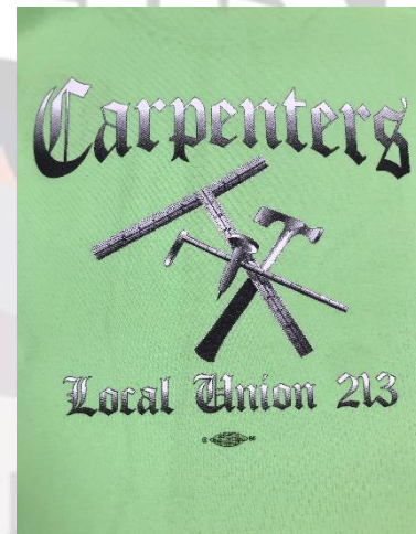
INTERIOR SYSTEMS DESIGN