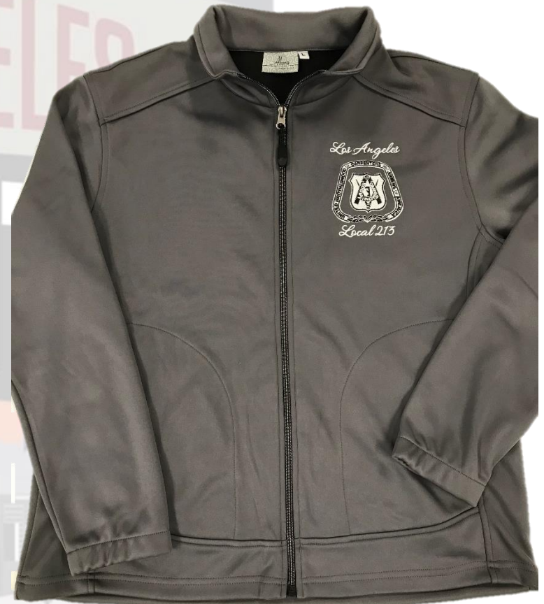
GREY JACKET $70