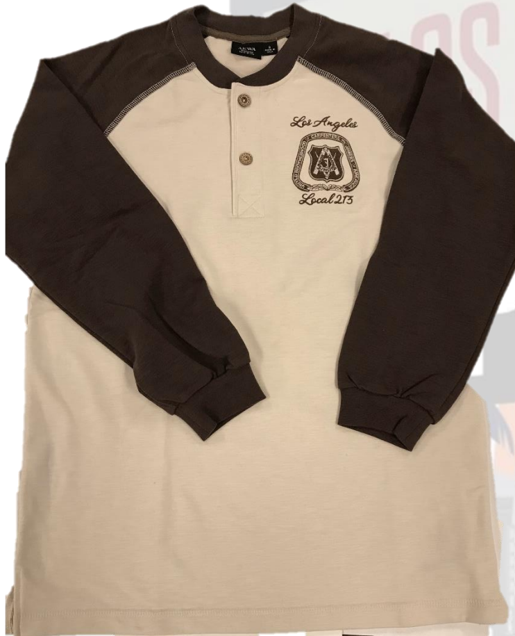
BRWON & BEIGE