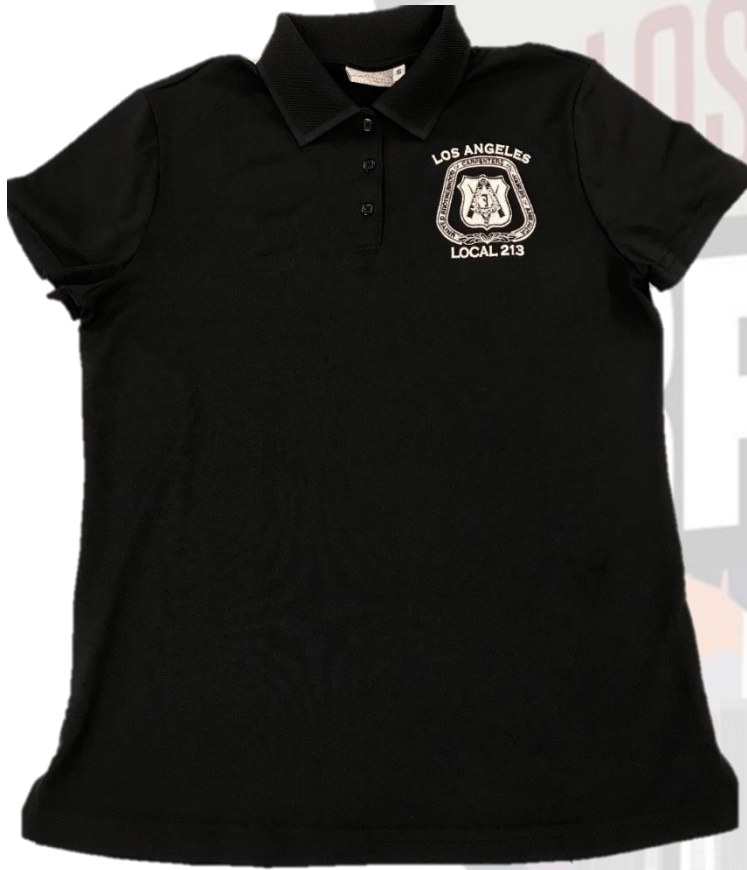
BLACK POLO $55