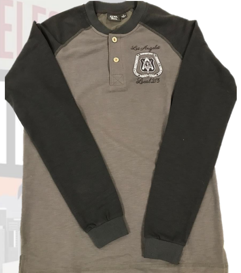
BLACK & GREY