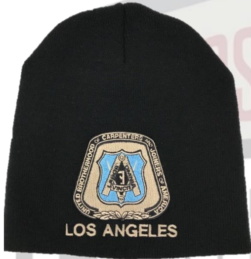
UBC DESIGN 8"