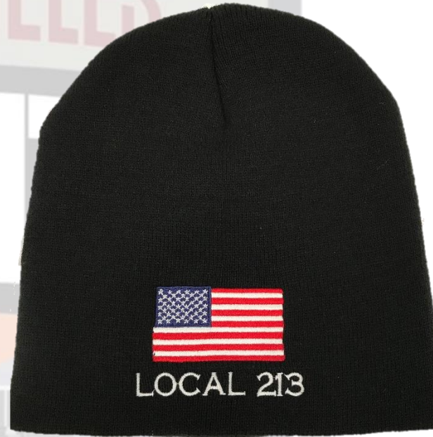
BACK DESIGN FOR BOTH STYLES