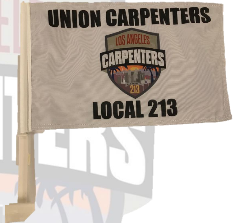
LOCAL 213 CAR FLAG $10