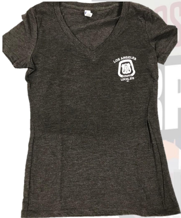
CHARCOAL GREY V-NECK $18