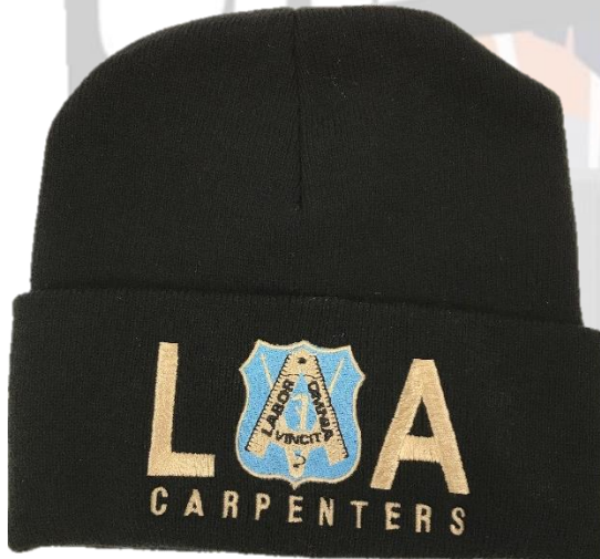
LA DESIGN 12"