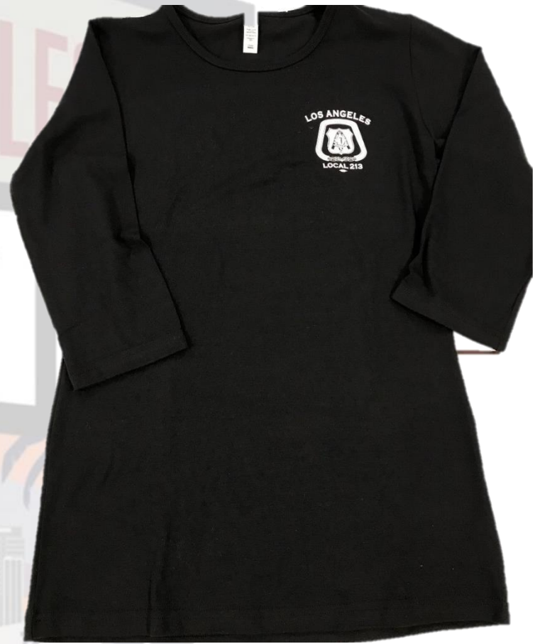
BLACK 3/4 SLEEVE SHIRT $20