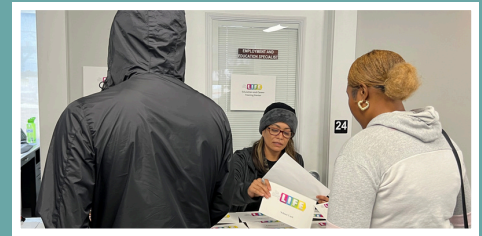
At the "start," everyone was presented with three options for paths to take: employment, education, or military service.

This game was a hit, helping young adults level up on life skills in a fun way. By facing real-world scenarios, they honed decision-making, problem-solving, and budgeting skills in a supportive setting.