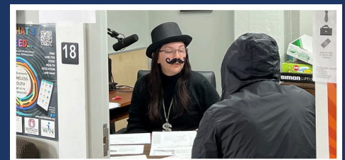
Each player learned about getting proper insurance coverage for their needs and how to file and pay their taxes.