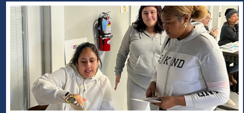
At the "leasing office," players were presented with rental options and learned about late fees, eviction, and paying for utilities.