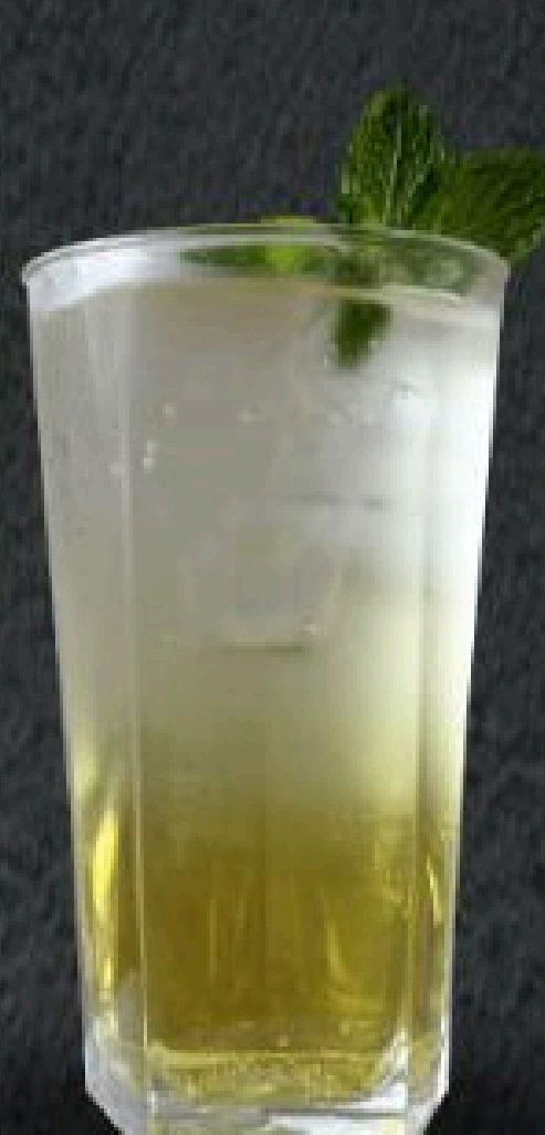
PEACH FROST ₺ 26