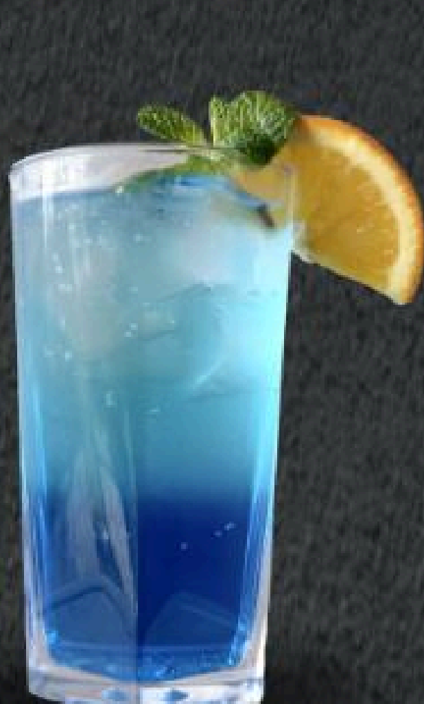
LEMON FUSION ₺ 26