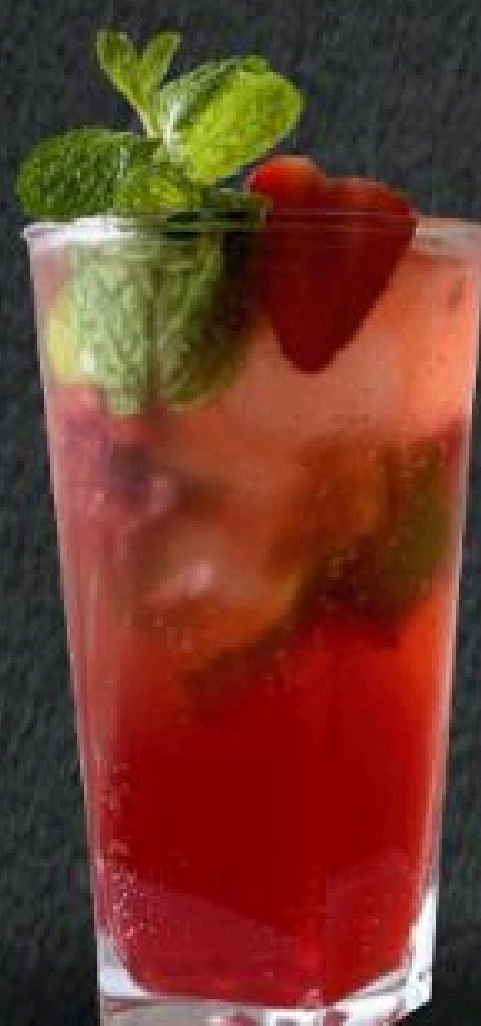
STRAWBERRY MOJITO ₺ 32