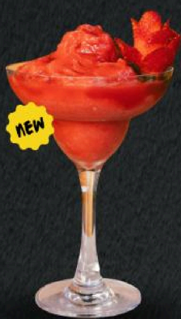
STRAWBERRY DAQIRI ₺ 32