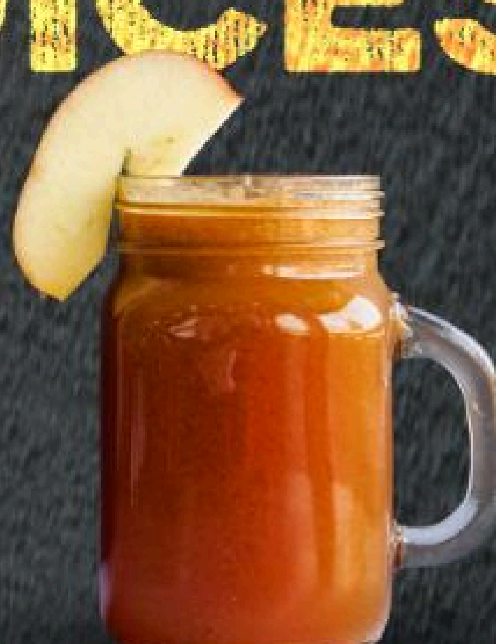
APPLE JUICE ₺ 30