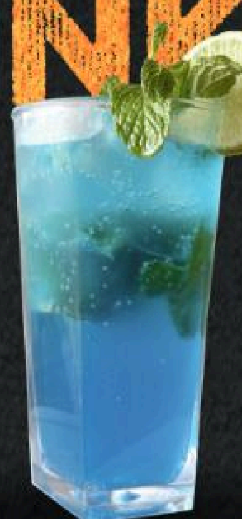
BLUE MOJITO ₺ 35