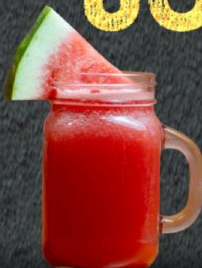
WATERMELON JUICE ₺ 30