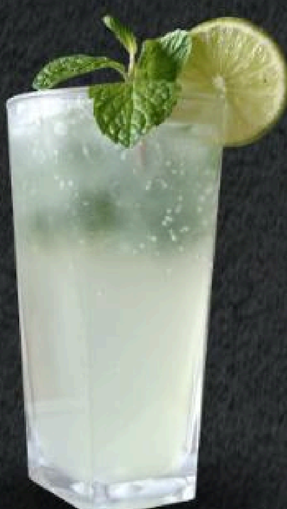
CLASSIC MOJITO ₺ 30