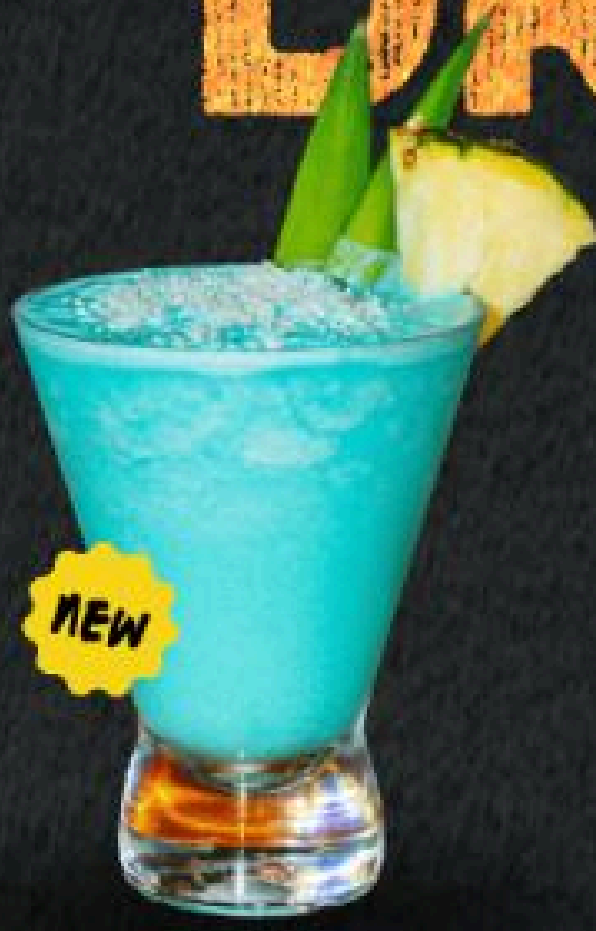
BLUE HAWAIIAN ₺ 37