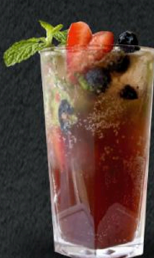
MIXED BERRIES MOJITO ₺ 37