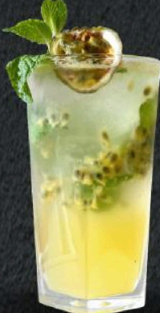
PASSIONFRUIT MOJITO ₺ 32