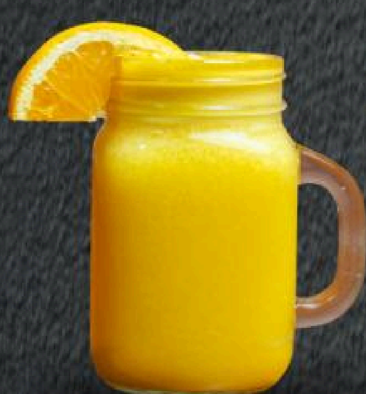
ORANGE JUICE ₺ 30