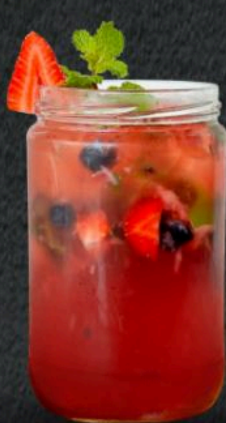
MIXED BERRIES MOJITO