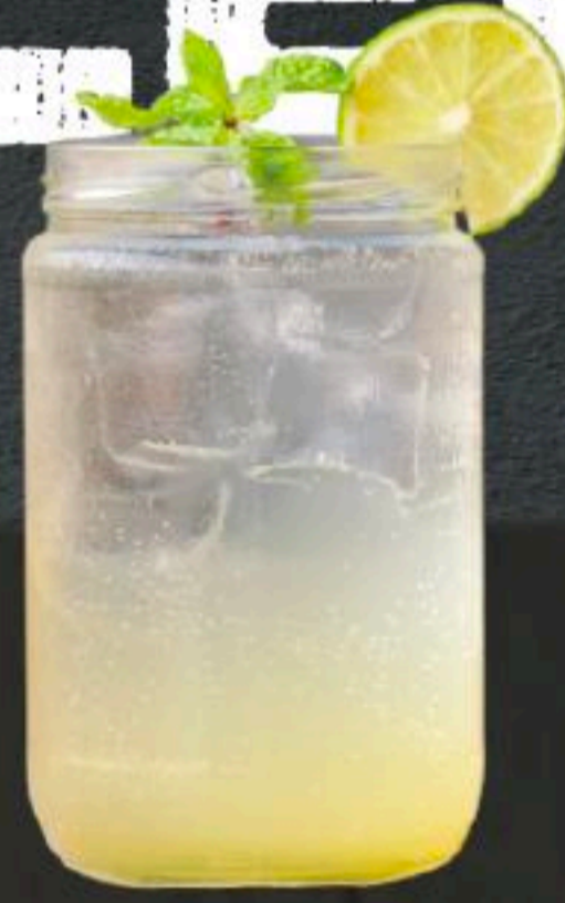
Peach Frost 26 AED