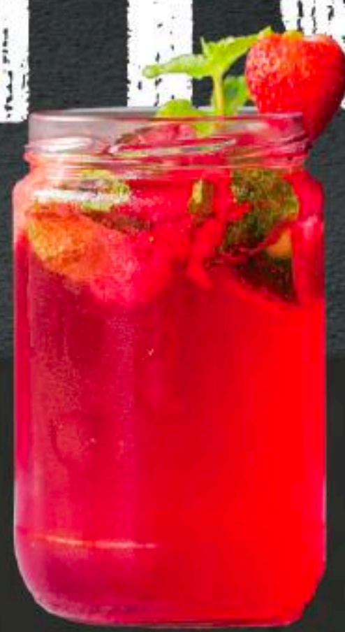
Strawberry Mojito 32 AED