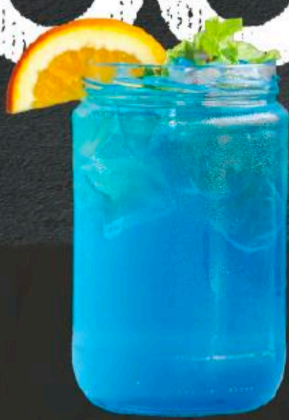
Lemon Fusion 26 AED