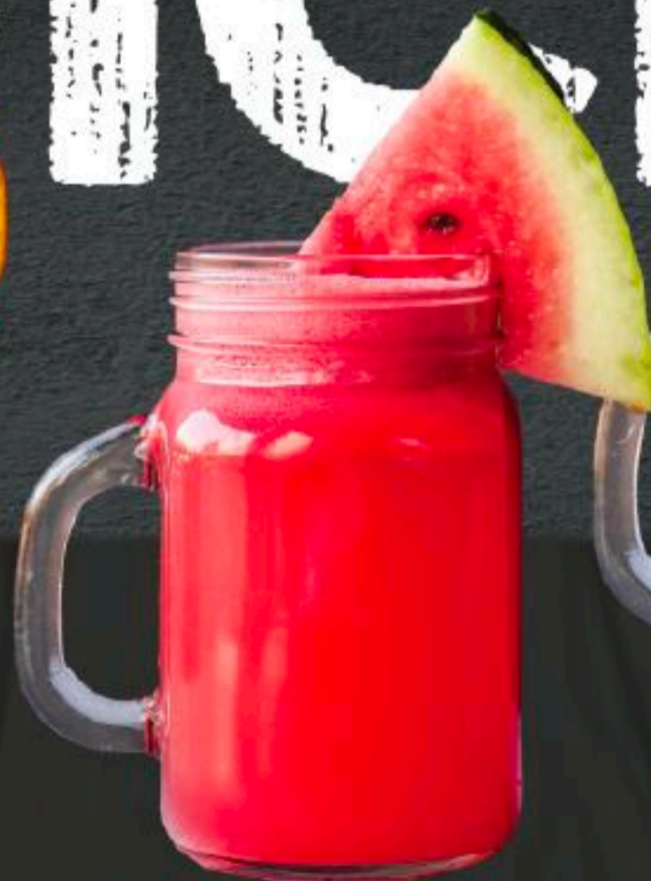
Watermelon Juice 30 AED