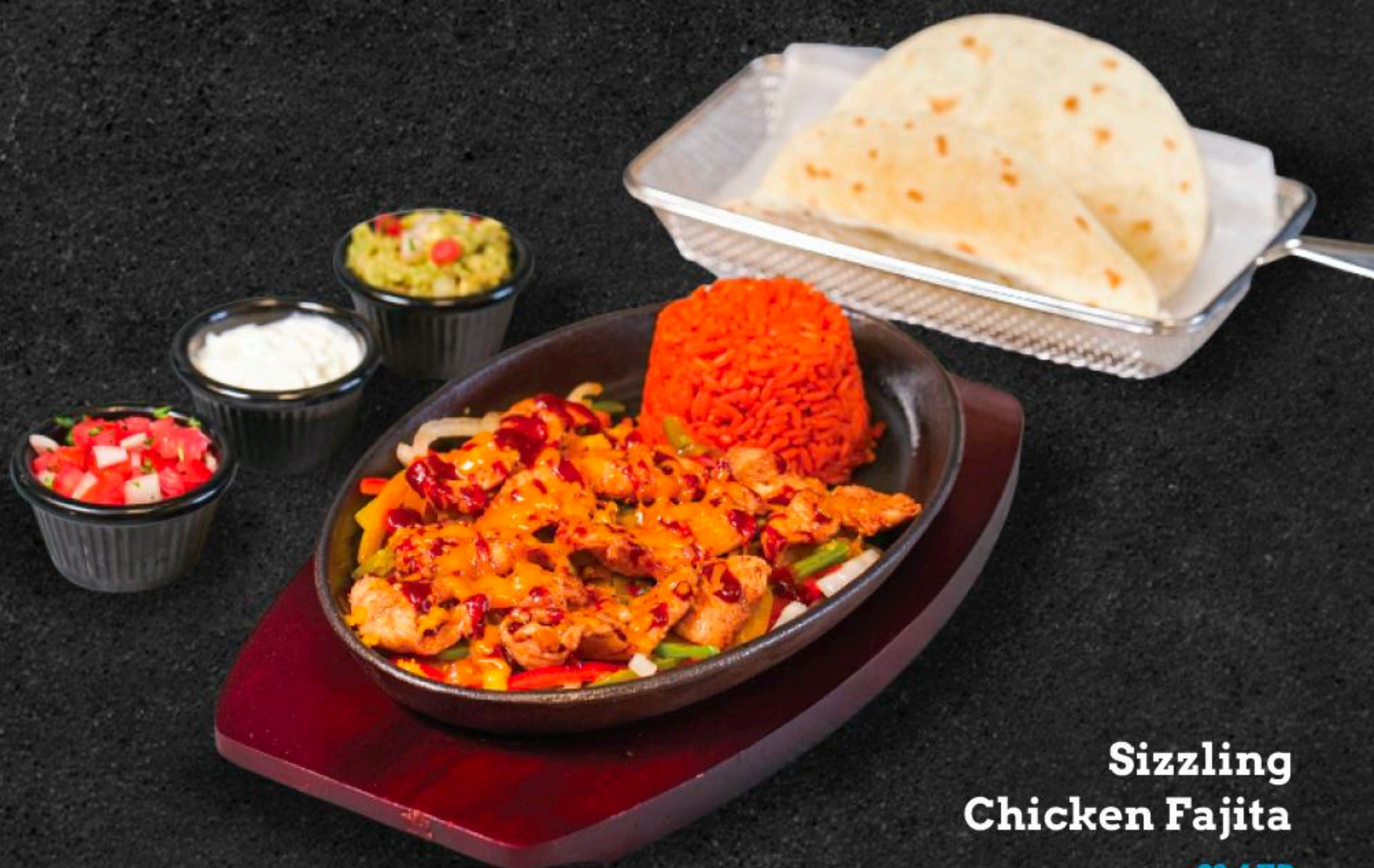
Sizzling Chicken Fajita

Your choice of Shrimp or Chicken seasoned & cooked to perfection mixed with bell peppers, onions, topped with cheddar cheese, and Mexican rice. Served with soft tortilla, guacamole, sour cream, and pico de gallo.