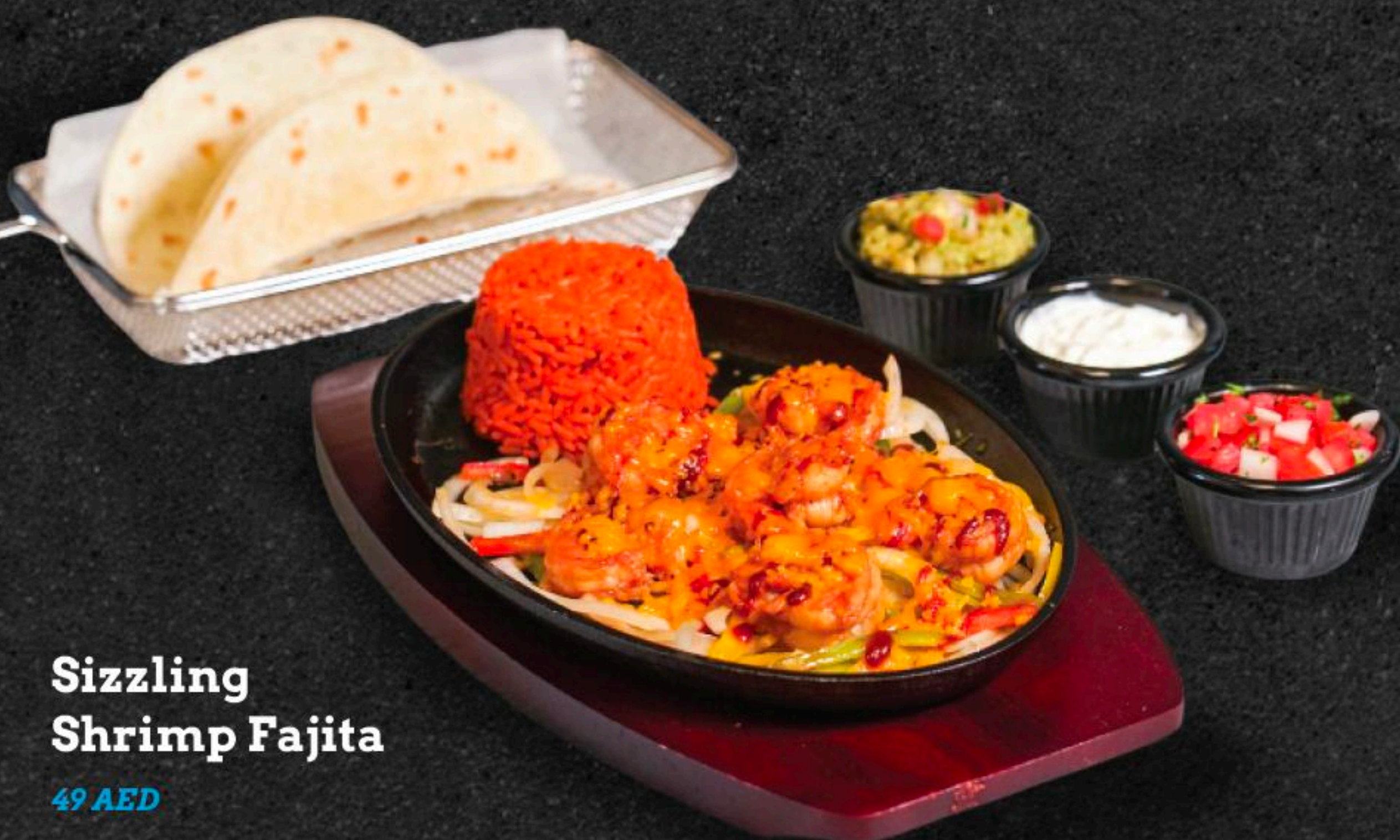
Sizzling Shrimp Fajita