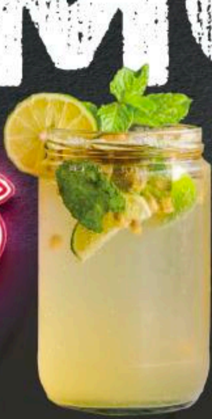
Passionfruit Mojito 32 AED