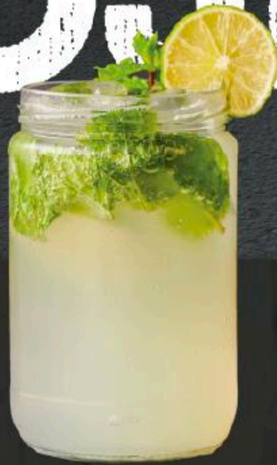
Classic Mojito 30 AED