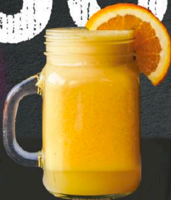
Orange Juice 30 AED