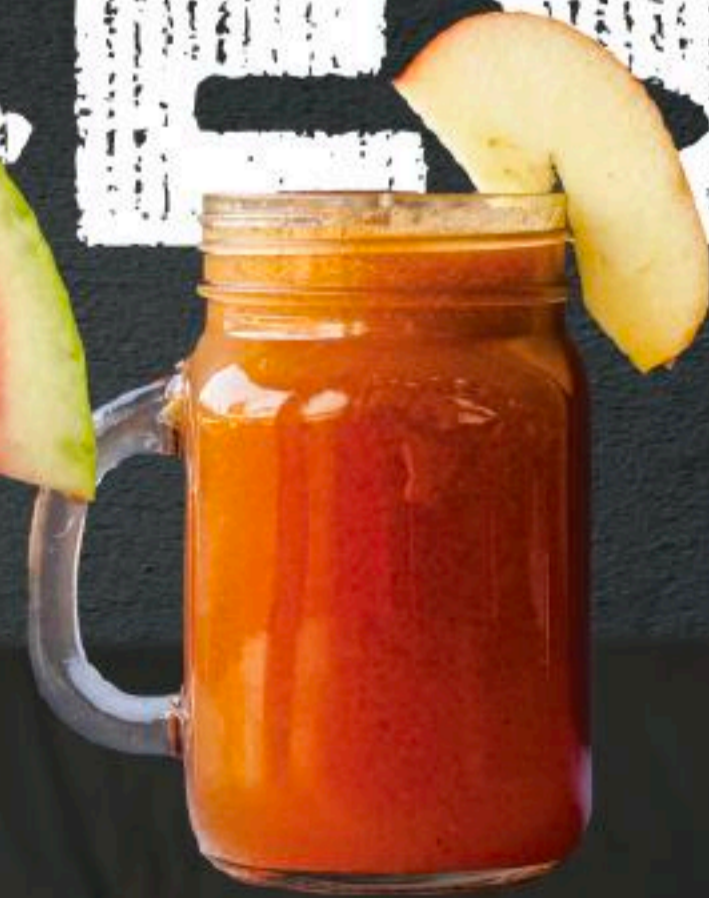
Apple Juice 30 AED