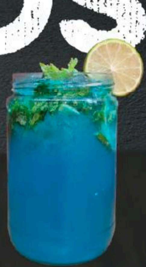
Blue Mojito 35 AED