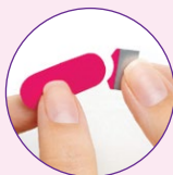
REMOVE TAB & SELECT END