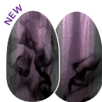
Smoke's On You shimmer