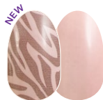
All Wild Up creme