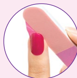
GENTLY FILE EXCESS OR REMOVE WITH FINGERNAIL