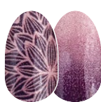
Rule of Plum shimmer