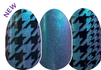
Suit Yourself shimmer