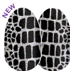
Hiss and Make Up