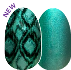
Snake My Day shimmer