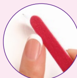
GENTLY FILE EXCESS OR REMOVE WITH FINGERNAIL