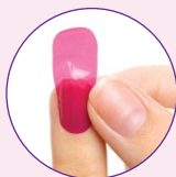
APPLY TO NAIL & GENTLY STRETCH TO FIT