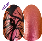
Wing It On shimmer