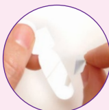
REMOVE CLEAR COVER & PEEL POLISH OVERLAY