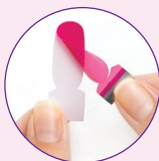
PEEL POLISH STRIP