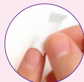
REMOVE CLEAR COVER & APPLY TIP TO FREE EDGE OF NAIL