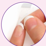
APPLY OVERLAY TO NAIL