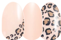
Trend Spotted creme